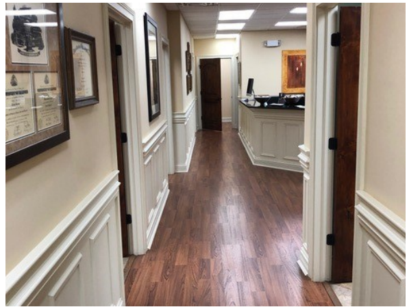
Hallway to 5 Exam Rooms