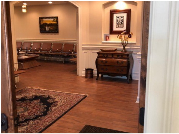
Large Reception/Waiting Area