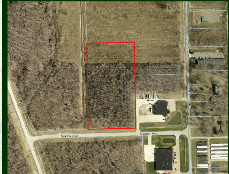
S/L Niagra Ave., Perry Twp, OH

No warranty or representation, express or implied, is made as to the accuracy of the information contained herein. It is submitted subject to errors, omissions, price changes, rental or other conditions, withdrawal without notice, and to any special listing conditions imposed by our client.