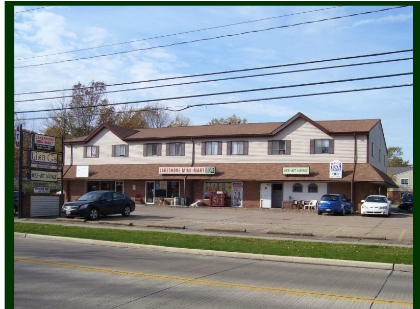
5800 Andrews Rd., Mentor-on-the-Lake, OH 44060

No warranty or representation, express or implied, is made as to the accuracy of the information contained herein. It is submitted subject to errors, omissions, price changes, rental or other conditions, withdrawal without notice, and to any special listing conditions imposed by our client.